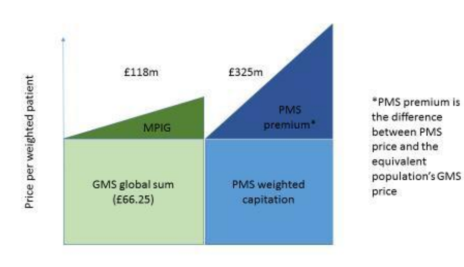
April 2013 NHS England assessment of GMS and PMS funding

NHS England conducted a review of PMS contracts at individual practice level based on April 2013 data to determine how much PMS funding was paying for 'core' services and how much was paying for enhanced services or other services over and above core GMS. This was used to create a revised total baseline figure for PMS practices equivalent to core GMS funding.